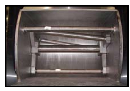
Optional Y-T Agitator